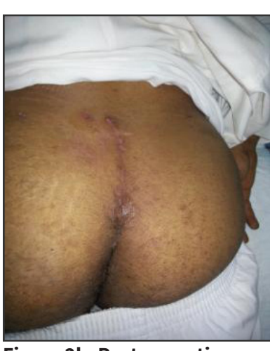
Figure 2b. Post-operative scar